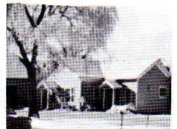
Home in Chadron, Nebraska